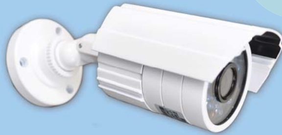
DeckScan 20/20 FW

This camera is not intended for submersion