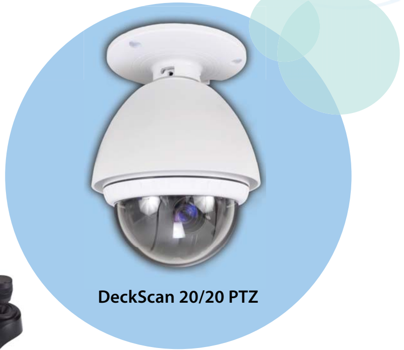
DeckScan 20/20 PTZ

The DeckScan 20/20 PTZ is designed as a rugged waterproof multipurpose video camera to be utilized on marine vessels of all types.